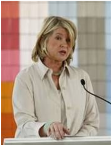
Martha Stewart says:

To keep potatoes from budding, place an apple in the bag with the potatoes.